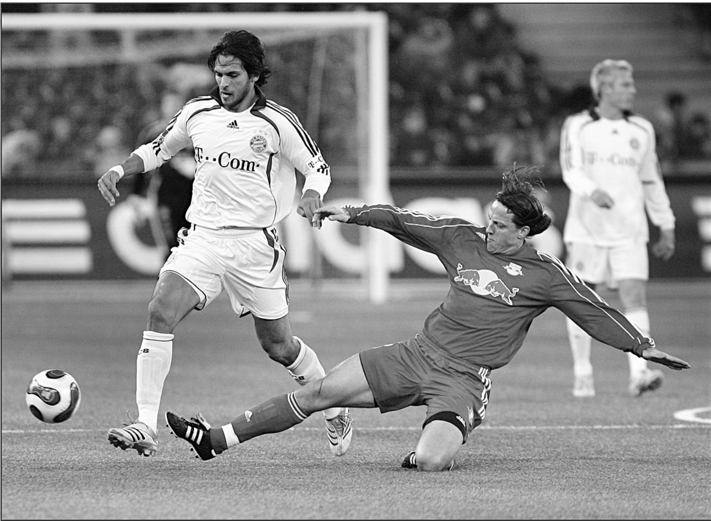
Bayern Munich striker Roque Santa Cruz (L) skips a challenge from Rene Aufhauser of Red Bull Salzburg during their Bulls Cup match in Salzburg on Tuesday. Bulls Cup is a friendly tournament involving Red Bull Salzburg, Bayern Munich and Urawa Red Diamonds of Japan.