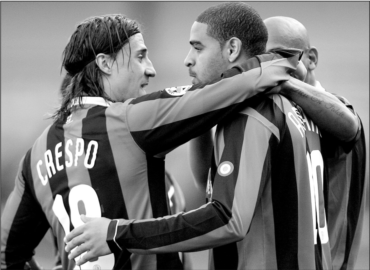
Inter Milan forward Hernan Crespo (L) congratulates Adriano after his strike partner bagged a first -minute goal during their Serie A match against Chievo in Verona on Sunday.