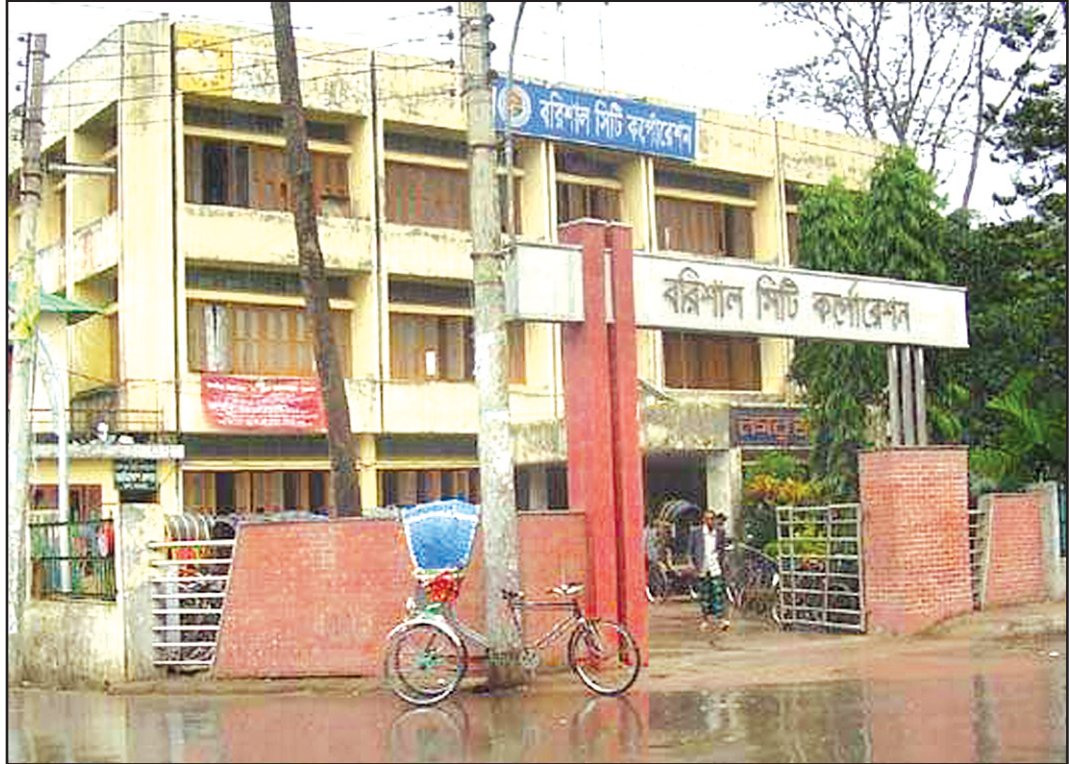
A desolate Barisal City Corporation complex as the city father and commissioners are not attending office.