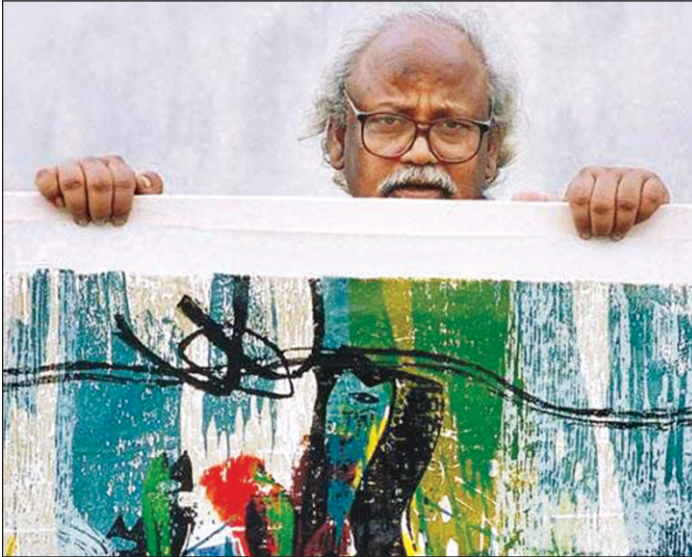
Stills from documentaries produced by Bengal Foundation

Already, the documentary culture seems to be picking up. Recently 16 documentaries were screened in Chittagong which gave art enthusiasts a chance to view some rare images and the creative process behind them.