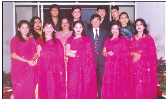
A 13-member cultural team from Bangladesh Shilpakala Academy left for Canberra, Australia to attend the 'National Multicultural Festival 2007'