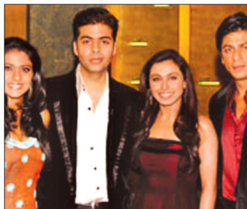
Koffee with Karan On Star World at 9:30pm Talk show hosted by Karan Johar Tonight's guests: Shah Rukh, Kajol and Rani