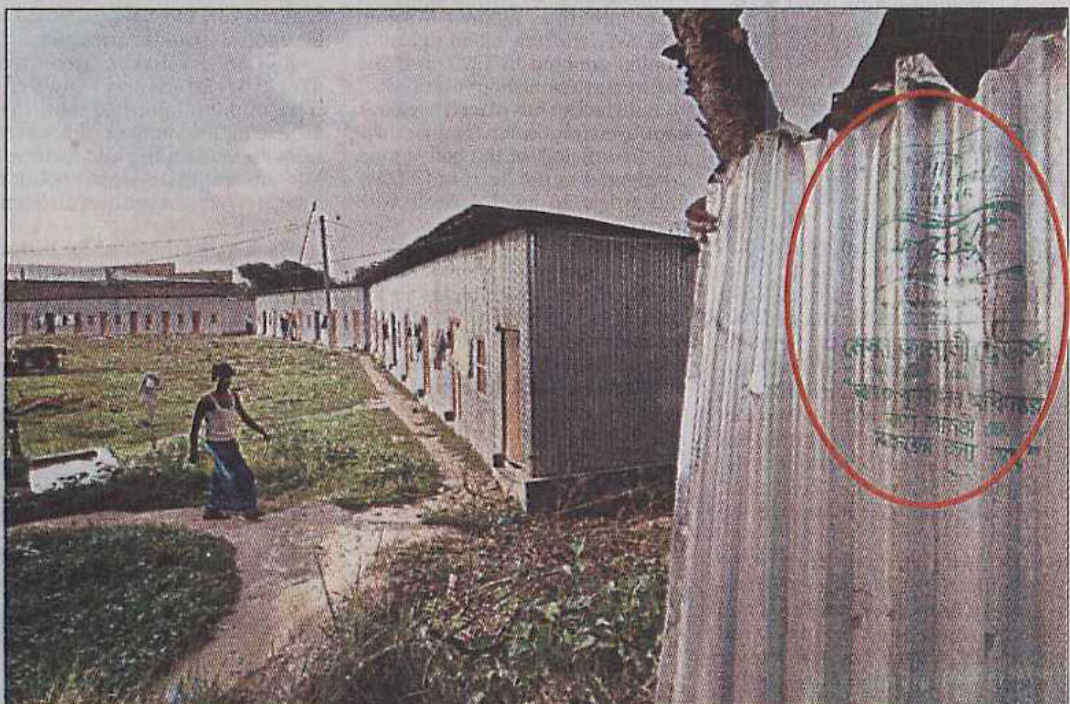
Joint forces seized 700 corrugated iron sheets marked "Relief materials of Relief and Rehabilitation Department: Not for sale" which were used for building structures at factory site of former BNP lawmaker Mosaddak Ali Falu in Savar.