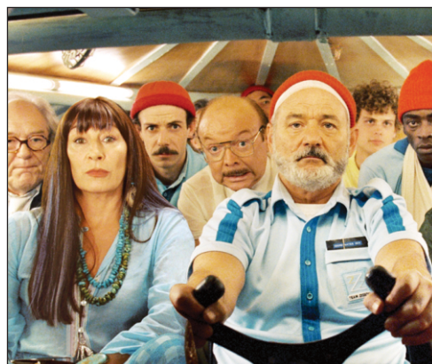
The Life Aquatic with Steve Zissou On Star Movies at 2:25pm Genre: Adventure/Comedy Cast: Bill Murray, Angelica Huston