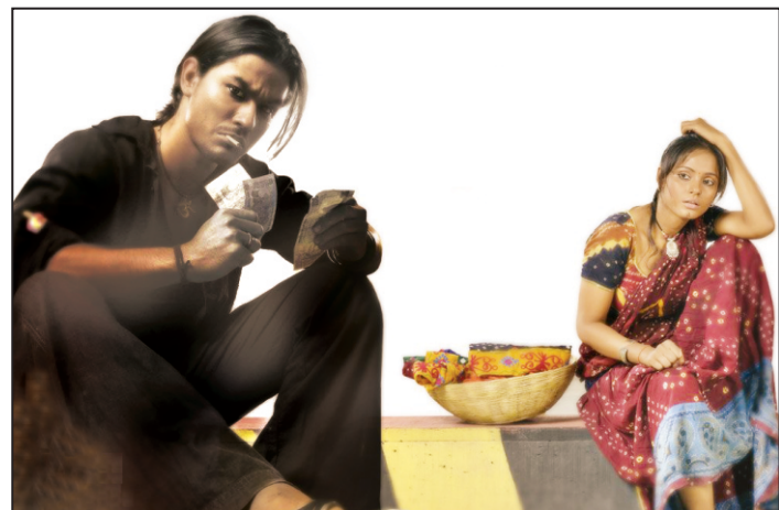
Kunal Khemu and co-artistes in the film