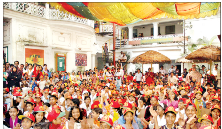
Hundreds of young participants at the Liberation War Museum premises