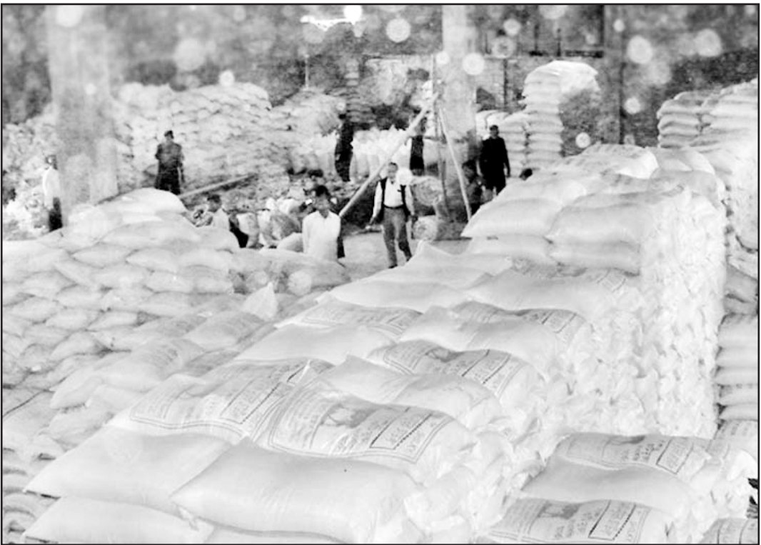
Joint forces seized 634 bags of banned FMP fertiliser and 1500 bags of uneatable rice in Chowmuhuni in Noakhali district yesterday and arrested a leader of Bangladesh Fertiliser Association and two leading traders.