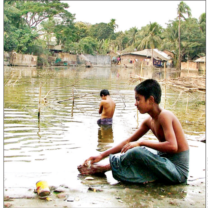
A road lying in a most dilapidated and miserable condition at Majpara in Panchlaish Ward, left, and people take bath in polluted water in a pond at Wazedia area, right.

"We are bound to charge Tk 10 to Tk 12 to go to ward commissioner's office from Oxygen Intersection for only one kilometre, as we are to spend additional money for maintenance of