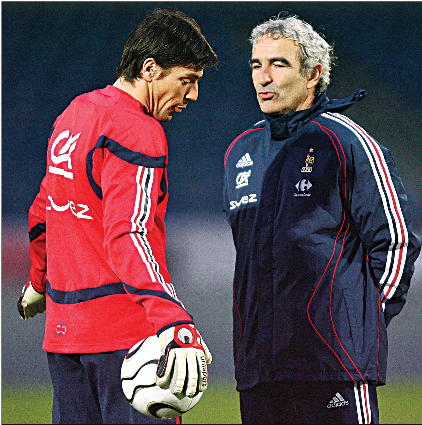
French goalkeeper Gregory Coupet (L) chats with coach Raymond Domenech at a training session for the Argentina friendly at the Michel Hidalgo Stadium in Saint-Gratien on Monday.