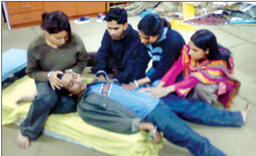
Actors of Jahangirnagar Theatre in the play

The curtains go up on seven revolutionary characters, who are arrested following failure of a secret operation, wandering around in custody how they got there. Confusion and dispute over the cause they fought for, take place frequently as they feel the presence of