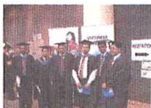
DSC Students Attending Convocation at Melbourne