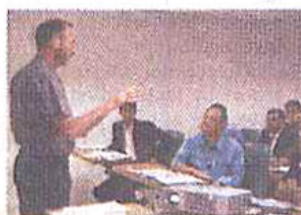
Melbourne Faculty Taking Class