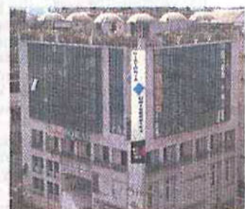
Dhaka Study Centre (DSC)

Last Date of Application - Feb. 28/07 Admission Test - March 03/07