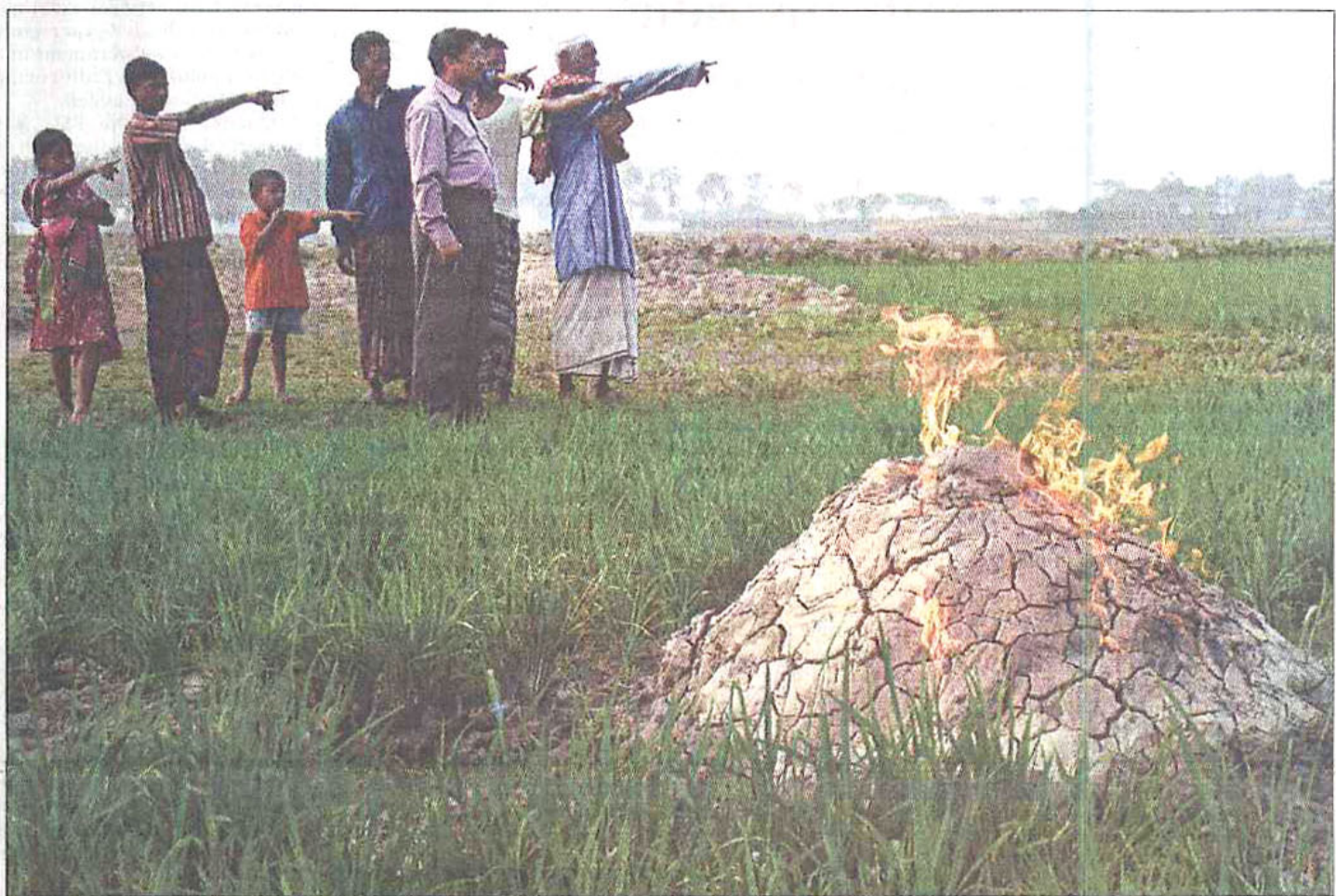
Gas is emitting through various cracks and holes in Titas Gas Field area in Brahmanbaria sadar upazila. The authorities are yet to take any steps in this regard.