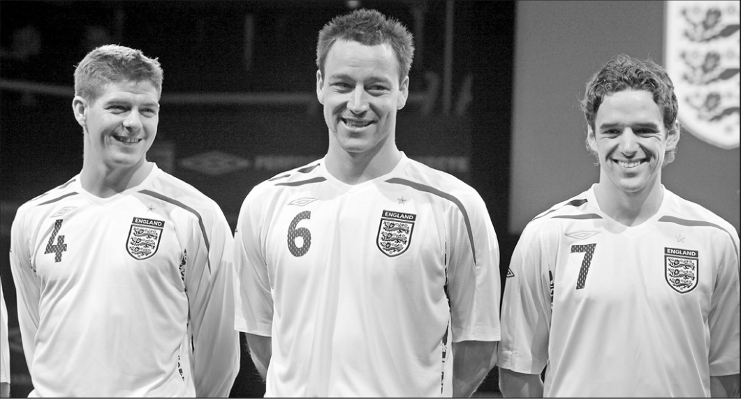
England players (From L-R) Steven Gerrard, John Terry and Owen Hargreaves model their new kit in Manchester on Monday.

admits that it is important to produce an impressive performance ahead of next month's testing qualifier in Israel. He said: "Every game for England is a must-win game and our next qualifier against Israel is definitely in that bracket." "We have got to show the fans and country on Wednesday that we really want to top our group, so it is important to get a good win and a decent performance against Spain." "England versus Spain is definitely a massive game from my point of view because I have a lot of Spanish team-mates at Liverpool and I don't want to return to my club on Thursday having just been beaten by them!" "When we last played Spain a couple of years ago, they gave us a lesson how to play because they were very good technically." "Recent results haven't been what we would have liked, so the challenge ahead of us is to put that right."