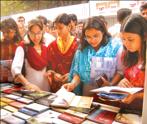
Boi Mela Protidin On Channel i at 5:30pm Live coverage from Ekushey Boi Mela

08:35 Shubho Shokal 09:05 Ki Jadu Bangla Gaaney 09:30 Shamol Bangla 10:10 Drama Serial: Krishno Pokho 10:40 Amar Ami 11:10 Public Forum 12:00 Amader Ranna Ghar 03:05 Drama: Dohonkal 04:20 Desher Pathay 05:00 Protidinor Boimela 05:30 Diner Sheshey 08:10 Drama Serial: Shonar Phool 09:15 Agamir Kontho