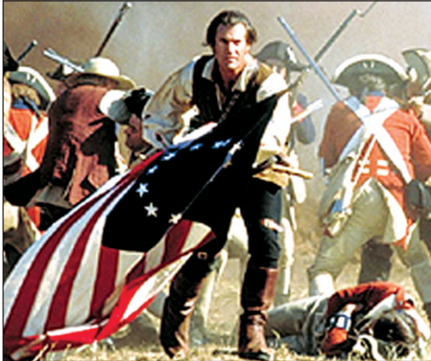
The Patriot On Star Movies at 8:35pm Genre: Action Cast: Mel Gibson, Joely Richardson

06:00 V Trailers - Star Plus 07:00 The Suite Life Of Zack And Cod 07:30 Prithviraj Chauhan 08:30 Baa Bahoo Aur Baby 08:30 Karam Apnaa Apnaa 09:00 Kasauti Zindagi Kay 09:30 Kaun Banega Crorepati-Srk 10:30 Kahaani Ghar Ghar Kii 11:00 Kyunki Saas Bhi Kabhi Bahu Thi 11:30 Kahiin To Hoga 12:00 Paraya Dhan 12:30 Paraya Dhan 08:15 Baby Geniuses 10:00 Wildfires 11:35 Undiscovered 01:15 Rapid Fire 03:00 Beethoven 04:30 Opening Night 05:00 Panic Room 07:00 Arrangement, The 08:35 Patriot, The 11:20 Operation Delta Force 12:55 Ginger Snaps: Unleashed