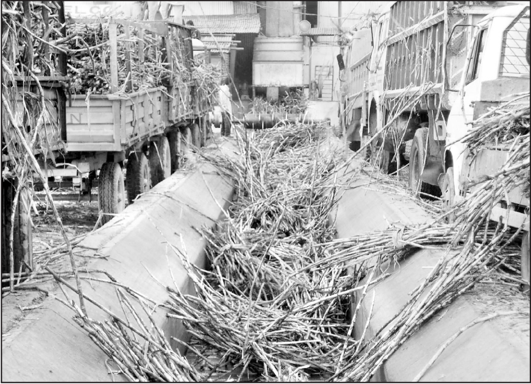
Sugarcane being crushed at Kaliachapra Sugar Mill in Kishoreganj.

He said, the yield per acre has increased to 700-900 mounds as farmers now cultivate sugarcane under agriculture experts provided by the mill. The mill purchases the sugarcane at Tk 60 per maund. A farmer can earn Tk 42,000 to 54,000 from one acre by growing sugarcane. They are more interested to cultivate sugarcane as this is more profitable than any other crop, he