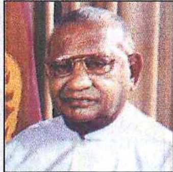
Ratnasiri Wickramanayake Prime Minister of Sri Lanka

A S we commemorate the 59th Anniversary of Independence let us move forward with renewed hope of sustainable peace, economic development and prosperity for all Sri Lankans.