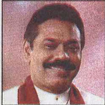
Mahinda Rajapaksa President of Sri Lanka

W E celebrate this 59th anniversary of Independence with great pride. On that historic occasion in 1948, the late Rt Hon DS Senanayake said Independence was obtained to reduce suffering and increase happiness among people without any discrimination on grounds of race, political affiliation,