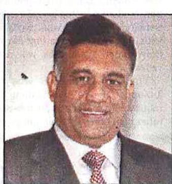
Rohitha Bogollagama Minister of Foreign Affairs

T ODAY, Sri Lankans all over the world celebrate the country's 59th anniversary of Independence with renewed hope for a peaceful and prosperous Sri Lanka.