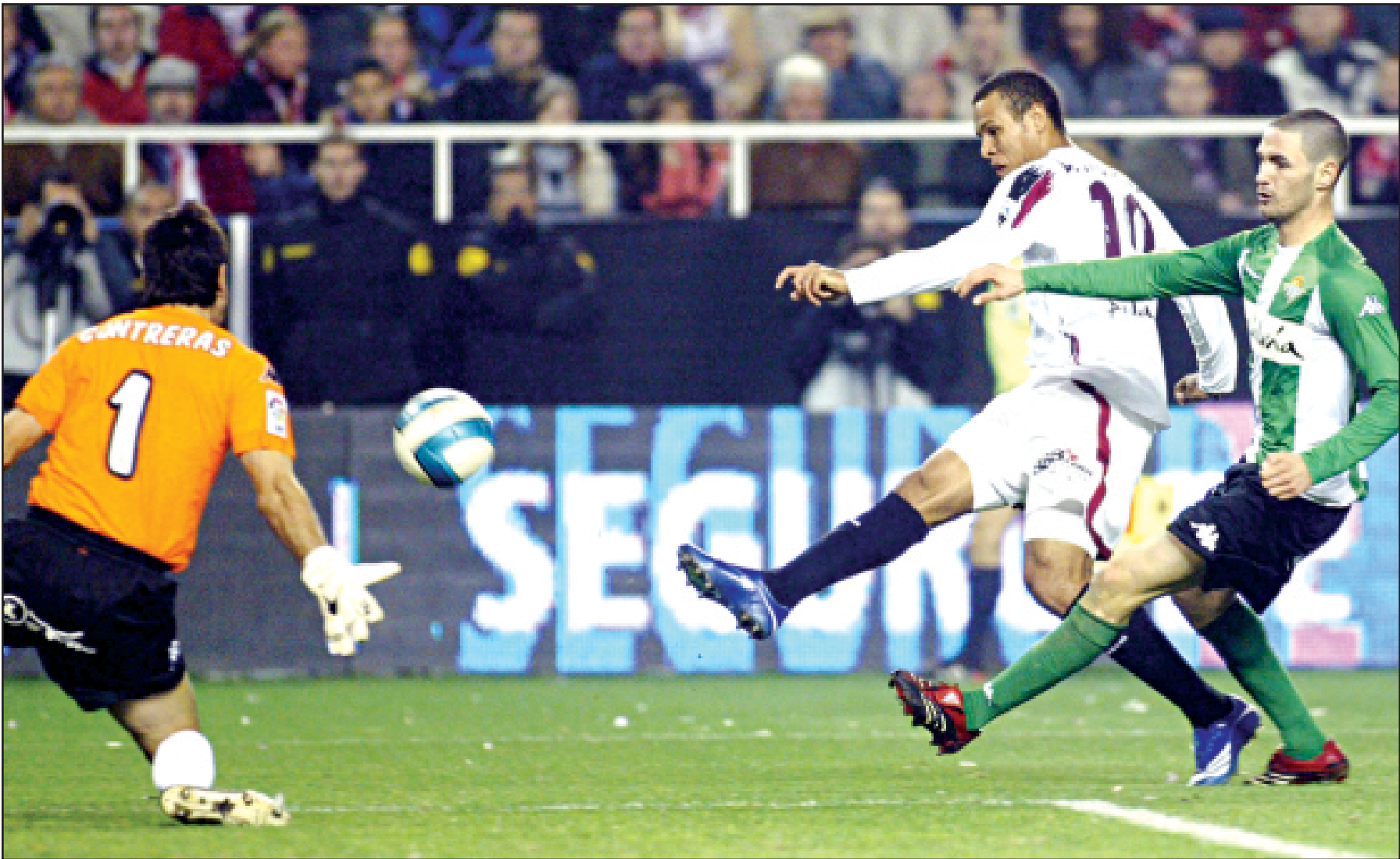
Sevilla's Brazilian striker Luis Fabiano (C) shoots towards Betis goal only to be blocked by 'keeper Contreras during their King's Cup match at the Sanchez Pizjuan Stadium in Sevilla on Thursday.