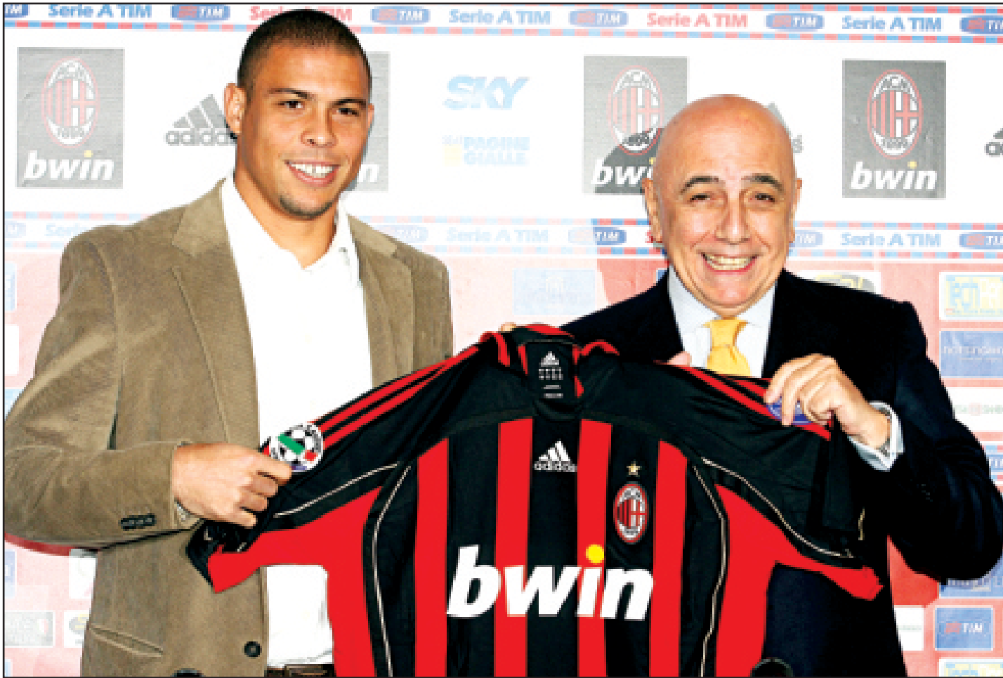
Brazilian superstar and new Milan signing Ronaldo (L) poses with his new jersey next to the club's vice president Adriano Galliani at a Milan hotel on Friday.