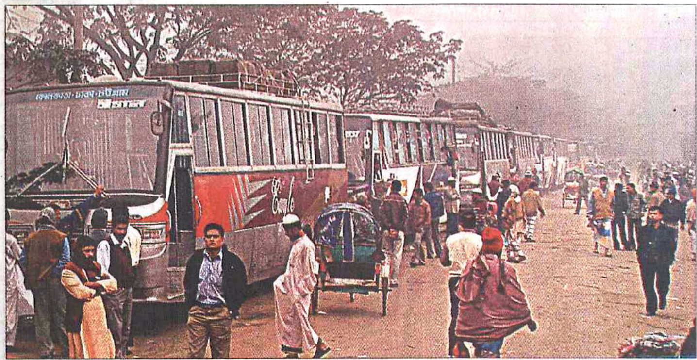
Passenger buses wait in queue as ferry service at Daulatdia comes to a halt for nine hours due to dense fog, creating one kilometre-long tailback yesterday.