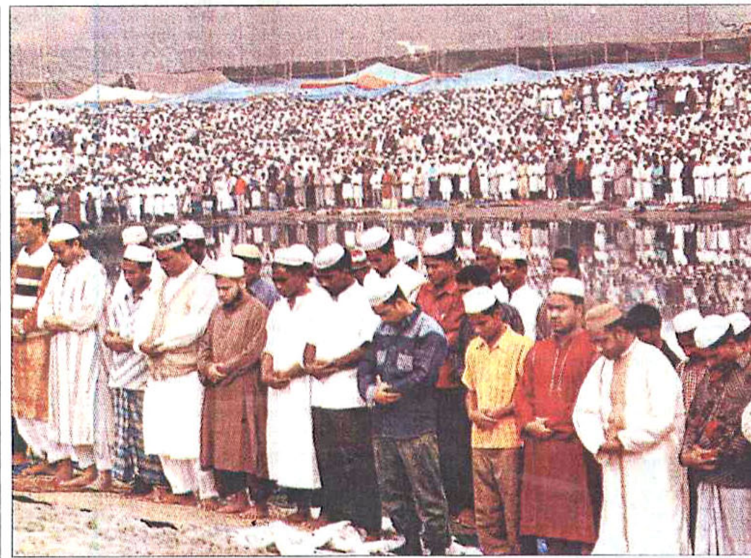
Devotees say Jum'a prayers on the bank of the Turag yesterday, the first day of Biswa Ijtema there.