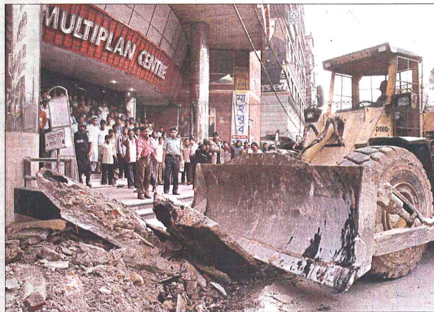
Rajuk bulldozes a sloping driveway to an underground car park of a shopping centre on Elephant Road in the capital yesterday.