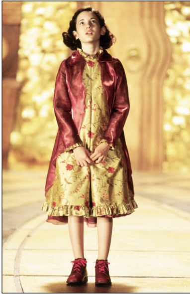
Ivana Baquero in del Toro's Pan's Labyrinth

"The film Babel is not about I am Mexican, and you are American," he said. "The point is we are human, and we are born naked before someone puts stupid passports on us and raises a flag."