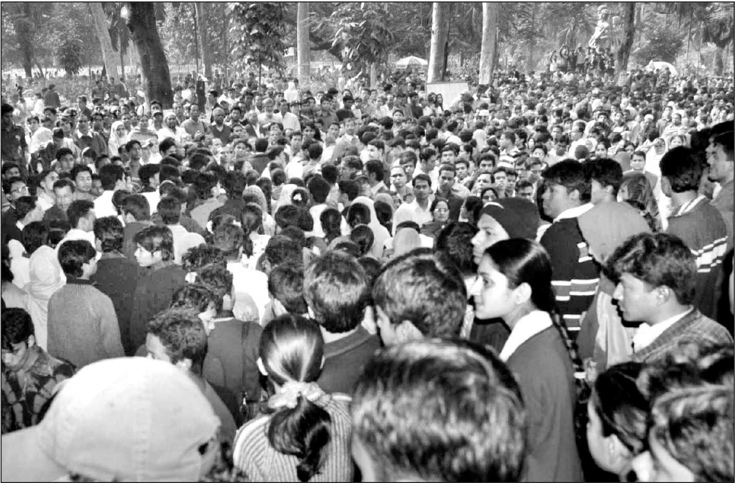
Admission seekers come out of the examination halls on the Dhaka University campus after taking the admission test under 'Ka' unit yesterday. Some 24,370 applicants sat for the admission test against 1,303 seats this year.

"We are trying to enhance the quality instead of quantity," she said.