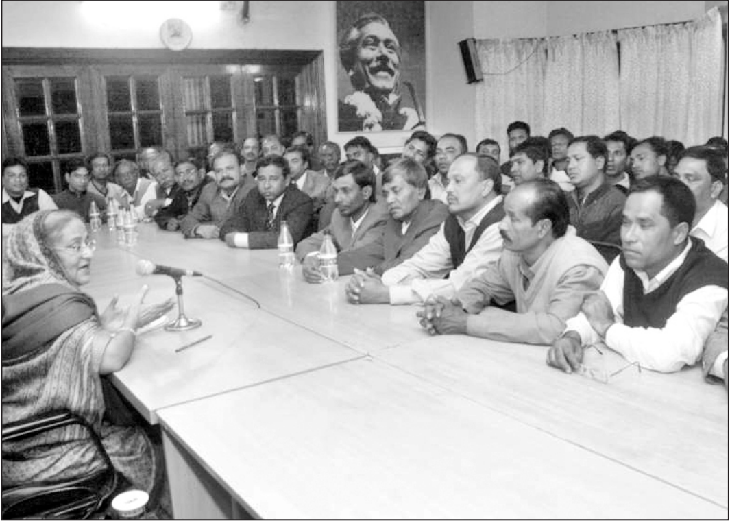
Awami League President Sheikh Hasina speaks at a view exchange meeting with the leaders of Rangpur district AL at the party's Dhanmondi office in the city yesterday.