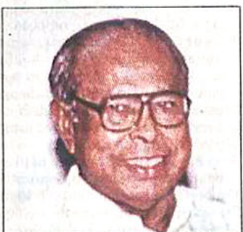
Shah AMS Kibria