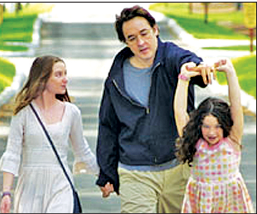
John Cusack (C) with co-actors in the film