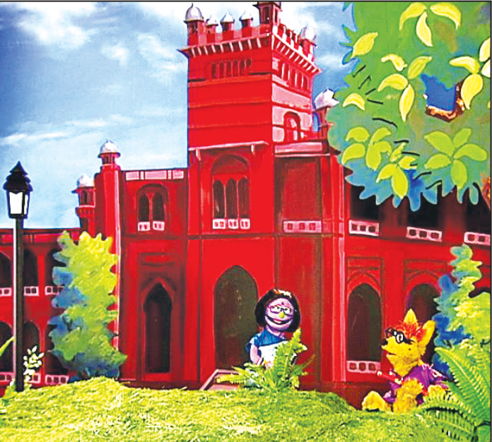
A scene from Sisimpur

For those who miss an episode, it is possible to see a re-telecast on the following Saturday, Monday and Wednesday at 2:05 pm.