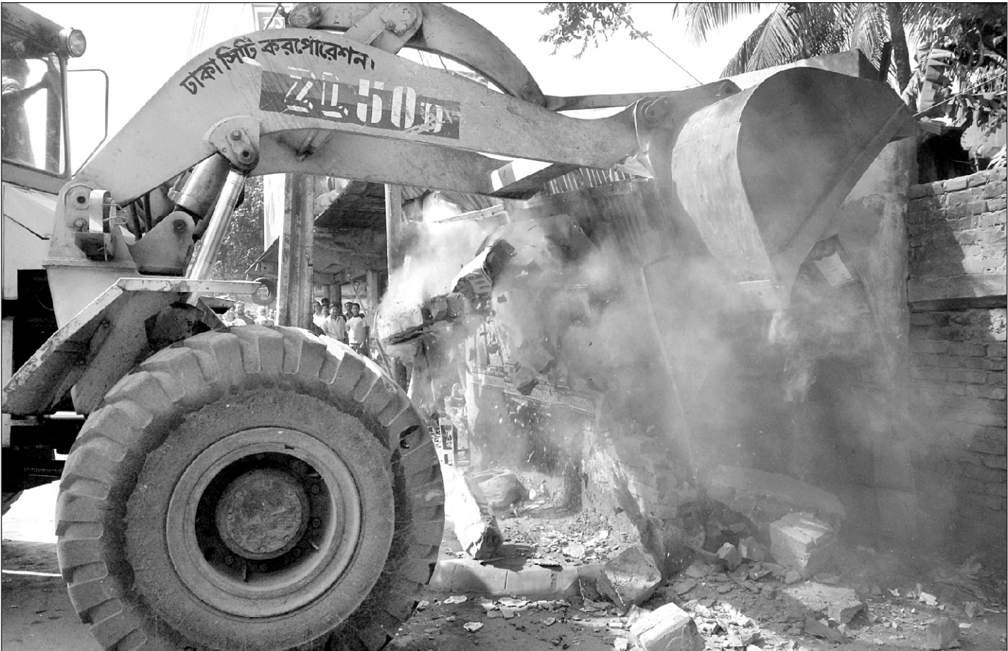
Dhaka City Corporation bulldozes illegal structures on roads at Mohammadpur in the city yesterday.