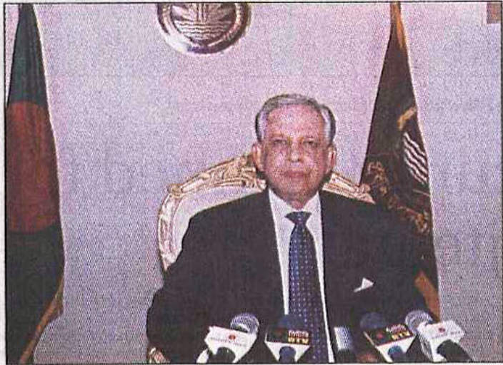
Chief Adviser to the Caretaker Government Dr Fakhruddin Ahmed addresses the nation yesterday evening through Bangladesh Television (BTV) and Bangladesh Betar.

Fakhruddin, who assumed office on January 12 to head a reconstituted caretaker government, said the main task of his