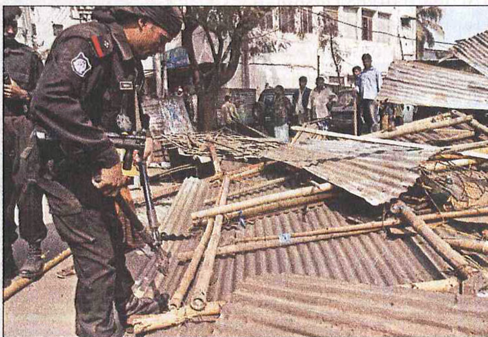
Rapid Action Battalion (Rab) men, left, demolish an illegal tin structure at Karwan Bazar in the capital yesterday leaving the local BNP office on the pavement in the same area unharmed.