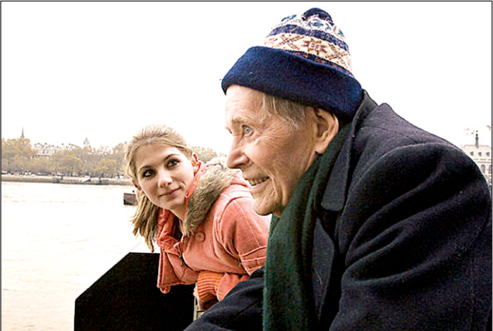
Peter O’Toole (R) and Jodie Whittaker in Venus

Seven-time Academy Award nominee Peter O’Toole proves genius is, if not eternal, lifelong. At 74, he’s being touted as a Best Actor Academy Award nominee again, for his performance in Venus . O’Toole is Maurice, an aged, once-“beautiful” British leading man of stage and screen. A cancer survivor, Maurice is at the stage in life when various ailments are vying to kill him. His marriage fell apart ages ago, and he and his ex-wife (Vanessa Redgrave) behave more like siblings. His children are grown and gone. His life is a flat, dull routine between prostate exams. But he still has a keen eye for the ladies. Maurice helps care for his old friend and colleague Ian (veteran actor Leslie Phillips), a fellow actor terrorised by a vulgar, voracious grandniece named Jessie (newcomer Jodie Whittaker), who has moved in with him. Jessie is a cockney Lolita in pink sweat pants, and Maurice takes an interest in her, in large part because he is still attracted to those two absolutes of human existence: youth and beauty. Maurice takes Jessie, whom he nicknames Venus in reference to the