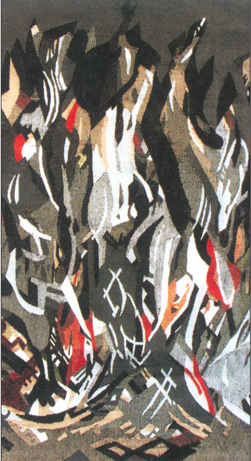
A jute tapestry by Tajul Islam