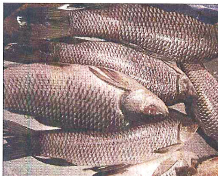
Are 'fresh' fish and fruits like these available in city markets safe for consumers?