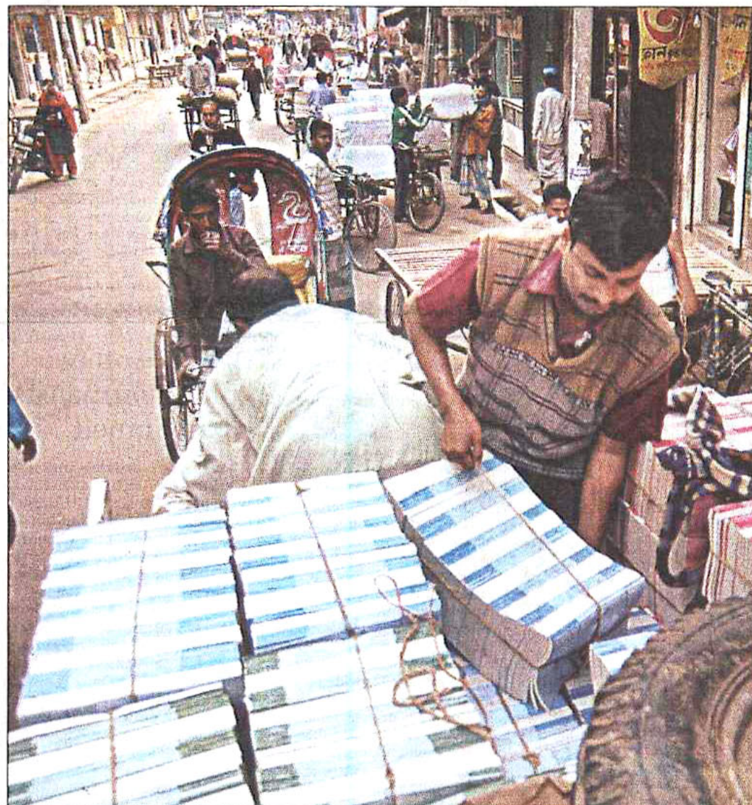
School textbooks are being taken to the stores at Banglabazar wholesale market in Dhaka yesterday. There are allegations of printing mistakes, missing pages and other errors in the textbooks.