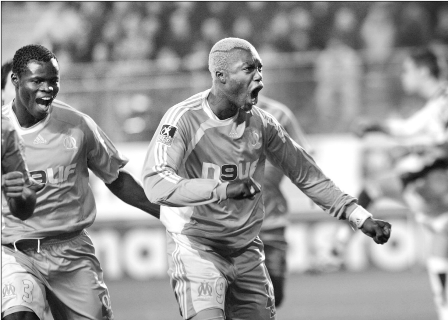
Marseille forward Djibril Cisse (R) is over the moon after scoring against Rennes during their Ligue 1 clash at Rennes on Sunday.