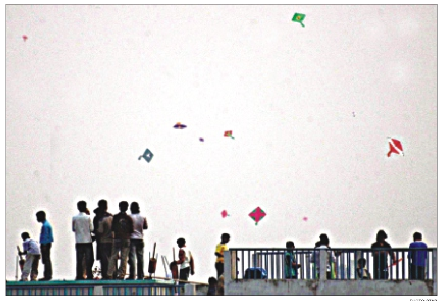
Young people fly kites in Old Dhaka yesterday celebrating Poush Sankranti, the end of Bangla month Poush.

UK denies any interference in Bangladesh politics UNB, Dhaka A spokesman for the British High Commission in Dhaka yesterday denied outright any involvement in Bangladesh's domestic politics of the day. "No, we are not interfering," the spokesman said responding to a question about some people and parties' impression that the UK and its western allies favoured the state of emergency to overcome the impasse over the general election. He said, "The election belongs to the people of Bangladesh. As good friends of Bangladesh, we believe in the potential of the country and its people; we support democracy, stability and security in SEE PAGE 15 COL 8