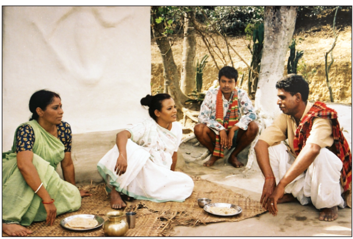
A scene from Kath Koylar Chhobi