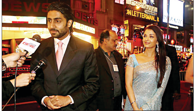
Abhishek Bachchan and Aishwarya Rai at the American premier of Guru

The red-carpet event for the movie Guru was a rare American treatment for a feature from Bollywood, the Mumbai-based film industry.