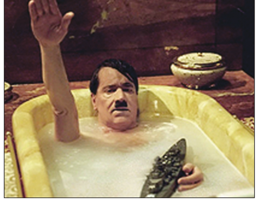
A scene from Mein Fuehrer