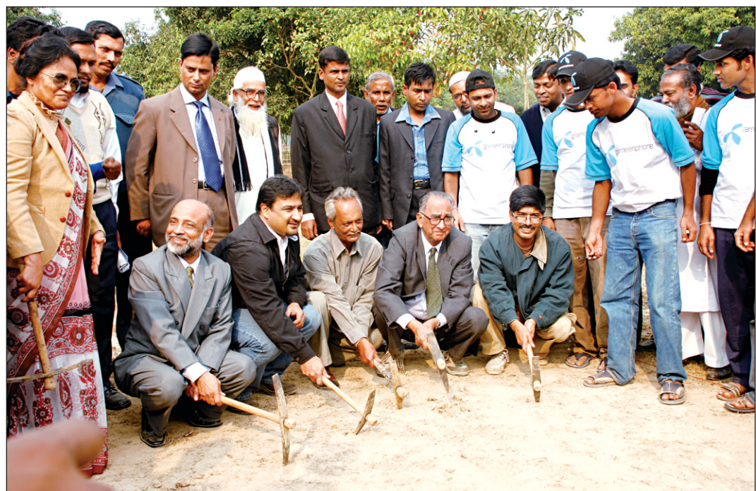
Former adviser to caretaker government Justice Habibur Rahman accompanied by archaeologists inaugurates excavation of relics dating back to more than 2,500 years at Wari-Bateswar in Narsingdi yesterday.