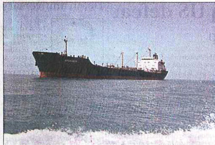
Greenpeace (an environment watchdog) blacklisted Apsheron, left, and Gudermes as the two ships are contaminated with toxic substances. The vessels are now in the Indian Ocean on their way to Bangladesh to be scrapped.