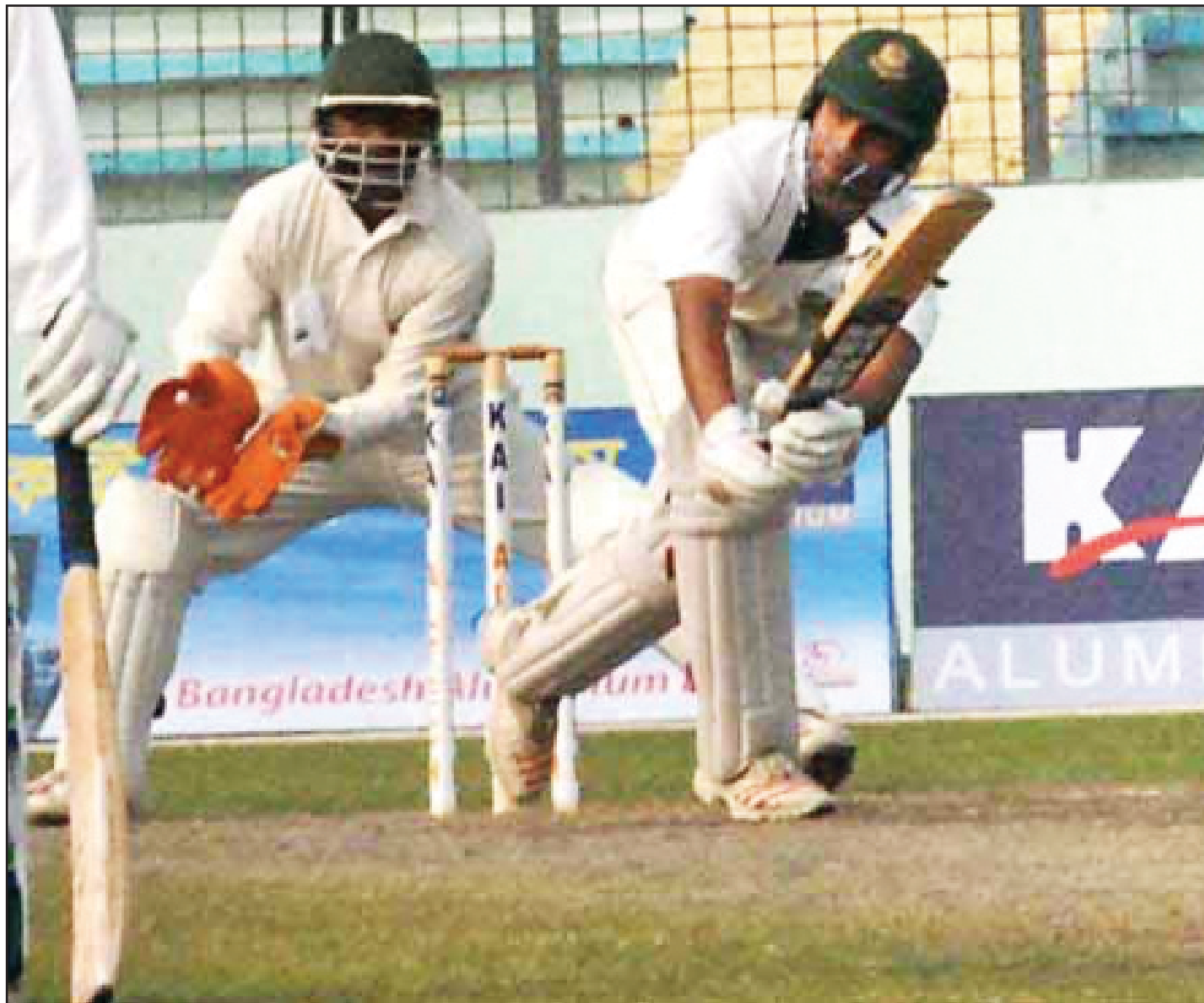
Old DOHS opener Tamim Iqbal flicks the ball towards mid-wicket during his sparkling 54 against Young Pegasus in the Kai-Altech Premier Cricket League at the Sher-e-Bangla National Stadium in Mirpur yesterday.