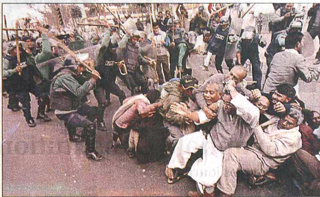
Police club grand alliance leaders including Awami League Presidium Member Tofail Ahmed and Workers Party President Rashed Khan Menon near Zero Point in the capital during the alliance's Bangabhaban siege programme.

A ferocious attack by AL activists using bricks and homemade