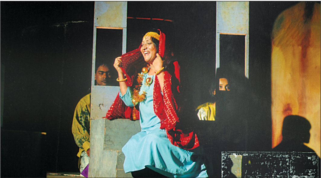
A scene from the play

Mohsin's central message is that if the war didn't take place, the protagonist wouldn't perhaps have been so confused and alienated, nor an AIDS victim. "There is always a logic behind a war, but a war shouldn't have such adverse effect on a normal person's life e.g. the hero didn't have to die in the flower of his manhood. I made up characters with fictitious names, as my imagination took wing. The elements of tears are blended with bits and pieces of joy." The author feels that people in this day and age can discuss and work out their problems -- without resorting to violent and gruesome wars.