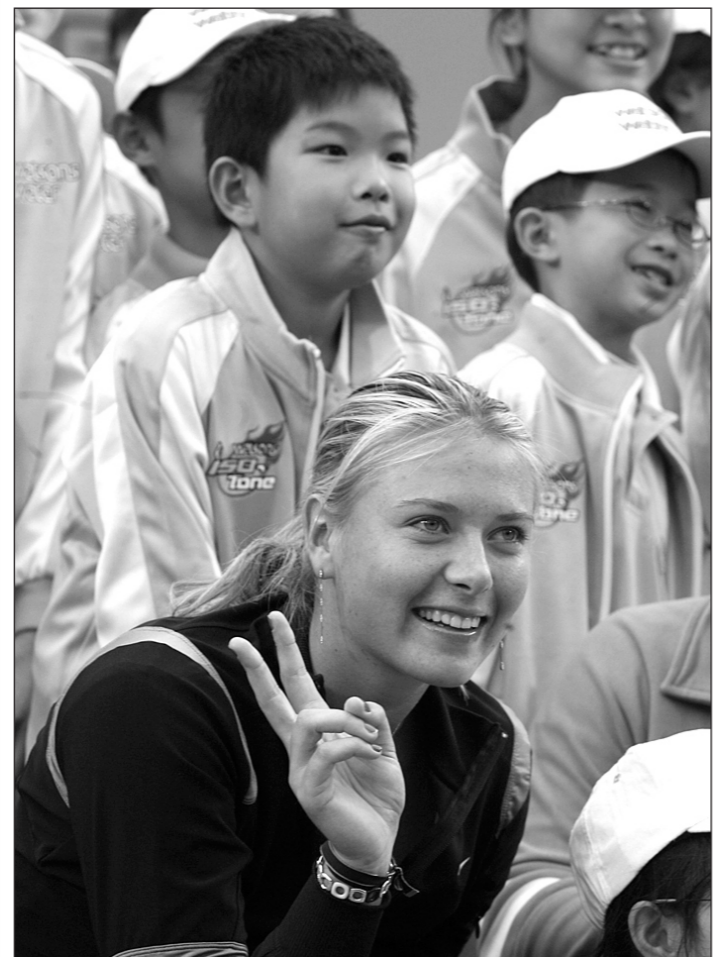
Russian tennis star Maria Sharapova flashes the victory sign as she poses for pictures with kids at a tennis clinic in Hong Kong on Wednesday.

CRYPTOQUIP J L F V Q L E M I T F T E W E J U Z Y T E J K V L F I Z F Q L ? O Z Y L F O Q L Z E M W L V E O M I I V L Z O M W E U K V Yesterday's Cryptoquip: IF A COUPLE OF TINY ARACHNID PARASITES WERE TO SPEAK, WOULD YOU CALL THAT TICK TALK? Today's Cryptoquip Clue: J equals W The Cryptoquip is a substitution cipher in which one letter stands for another. If you think that X equals O, it will equal O throughout the puzzle. Single letters, short words and words using an apostrophe give you clues to locating vowels. Solution is by trial and error.