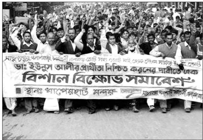
(Clockwise) A BNP aspirant's supporters wearing burial cloth block a road in Chandpur town, Awami League activists lie on road during hartal in Purbadhala in Netrakona protesting nomination to a party leader, BNP men form human chain in Mymensingh town demanding change in nomination and an Awami League procession in Gaibandha-3 for ticket to their leader.