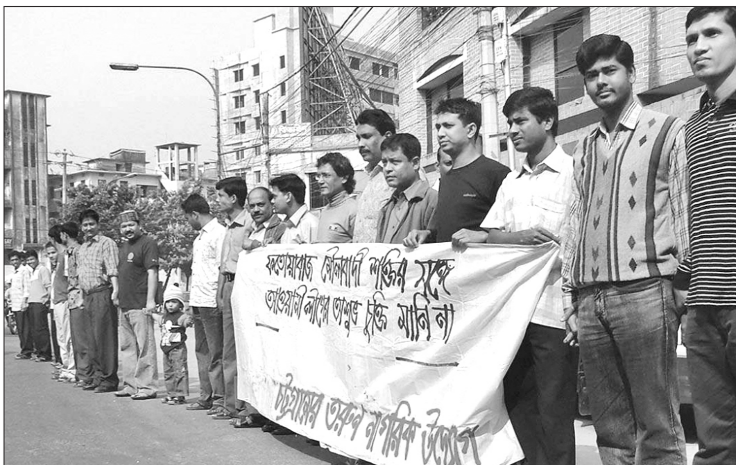
Torun Nagorik Uddog, a youth organisation, formed a human chain in Chittagong city yesterday demanding cancellation of Awami League's recent agreement with Khelafat Majlish.

A tense situation was prevailing in the upazila yesterday.