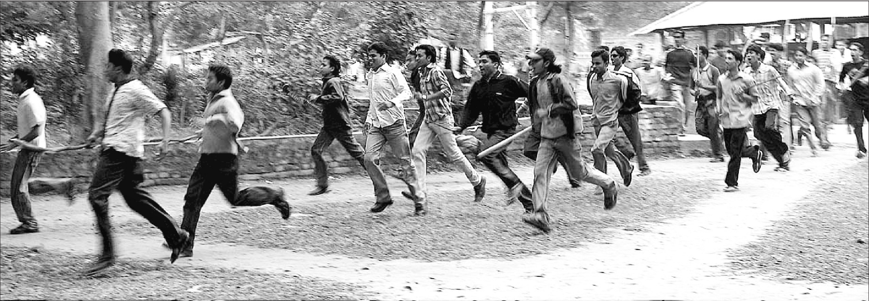
Activists of Jatiyatajadi Chhatra Dal (JCD) chasing their Chhatra League rivals a with sticks and rods on Rajshahi University campus yesterday. (story on page 16).