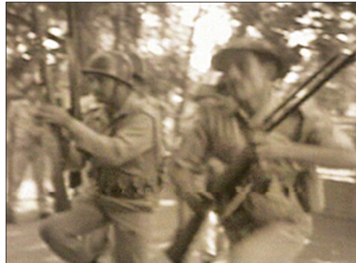
A scene from the documentary

The show features the contribution of Mahmud during 1971 and an interview session with the relatives and friends of Shaheed Altaf Mahmud.