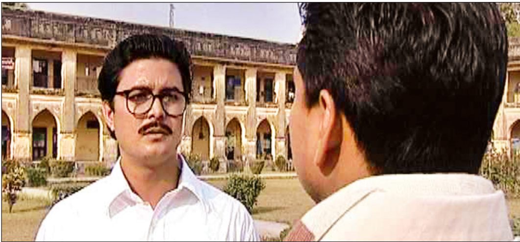
A still from Krishno Gohbor

also includes the memories of the martyred intellectuals narrated by family members and colleagues. Krishno Gohbor features Shaheed Munier Choudhury's childhood, family life, accomplishments and tragic events of the day he was abducted.