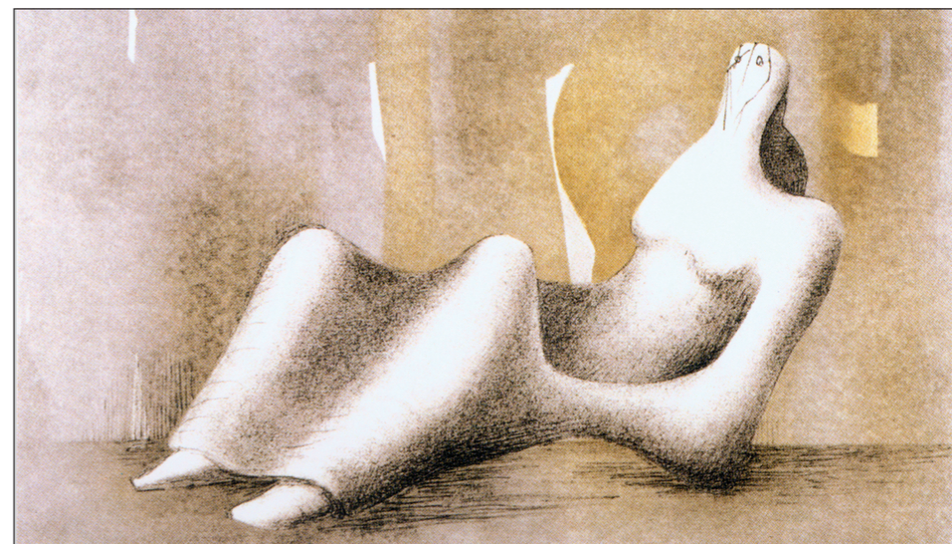
Reclining Figure Dawn, by Henry Moore