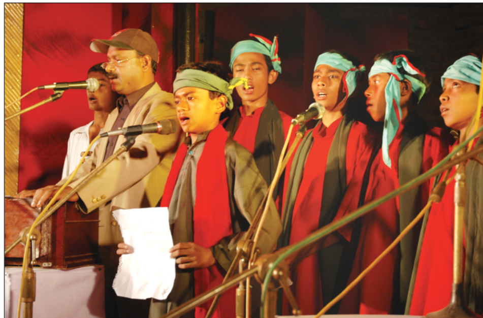
Students of Domar Bohumukhi High School, Neelphamari sing at the programme