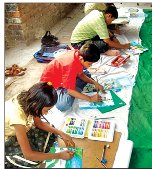
Marking the Victory Day, a painting competition for school children was held at a local club recently in Mymensingh