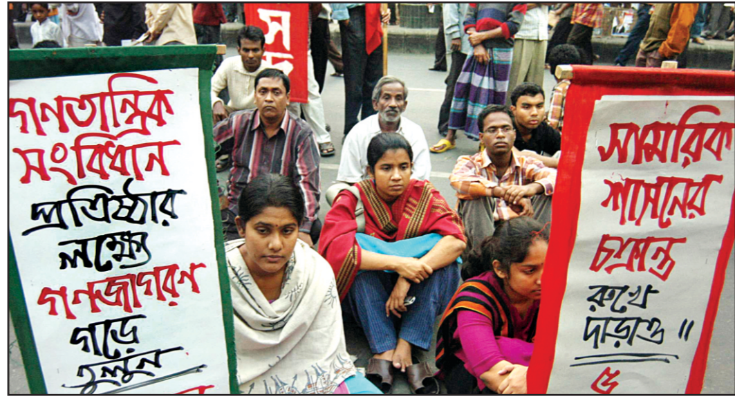
Gono Mukti Andolon and Five-Left Party stage a demonstration at Mukhtangan in the city yesterday protesting army deployment in the country.

The veteran BBC journalist, who covered the South Asian region in 1971, urged the Bangladeshis to establish the spirit of the War of Liberation to win the fight against poverty. The Liberation War was only the beginning, he said, adding that the people of this region are yet to achieve their victory over poverty. Regarding the people's potentiality to overcome all the obstacles to development, he said, "They have the ability to be super