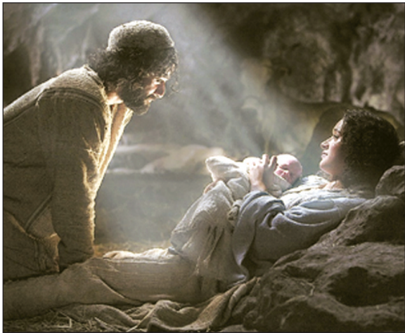
Oscar Isaac and Keisha Castle-Hughes in The Nativity Story

The Nativity Story comes across more like a tedious morning in Sunday school than a compelling biblical account. Far from a magical version of the story of Christ's birth, it is unlikely to inspire the ardent following among Christians that The Passion of the Christ did. And while there is unquestionably an audience for this film, Nativity is not bound to become a holiday classic. While focusing on Mary (Keisha Castle-Hughes of Whale Rider fame) and Joseph (Oscar Isaac) is an intriguing idea, this retelling doesn't offer much insight into her character. The angel Gabriel ( Syriana 's Alexander Siddig) informs Mary that she is to be the mother of Jesus, but Castle-Hughes plays Mary as one-dimensionally as a student in a school Christmas pageant might. It can't be easy for a teenage actress to take on such a lofty role, but Castle-Hughes seems to have lacked critical input from director Catherine Hardwicke. Hardwicke has taken a fascinating topic and presented it at a glacial pace and without much of the insight she showed in previous films. The movie just feels dreary. However, this version seems fairly faithful to the biblical narrative, with two striking exceptions: the wrongheaded decision to turn