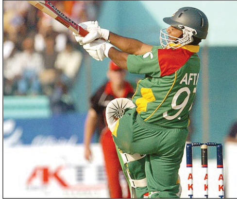
Bangladesh Vs Zimbabwe On BTV at 1:30pm Second match of the five one-day matches