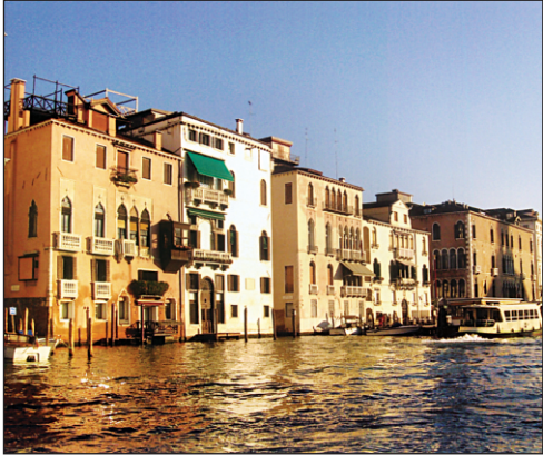
Lost Ship of Venice On Discovery Channel at 8:30pm The unique example of the first Two Thousand years of navigation