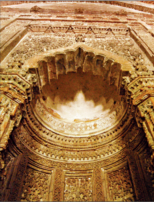
Photographs from the book (L-R): Kusumba Mosque (Naogaon), Bazra Mosque (Noakhali) and Bagha Mosque (Rajshahi)