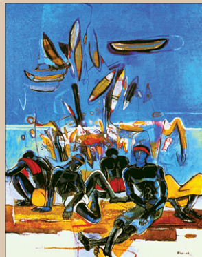
Title: Down Memory Lane Artist: Rafiqun Nabi Venue: Bengal Gallery of Fine Arts, Bengal Shilpalaya, House no-275/F, Road no-27 (Old), Dhanmondi Date: November 20-December 3 Time: 12:00pm-8:00pm