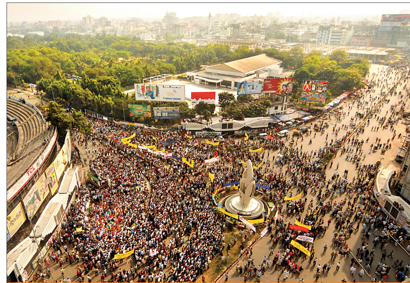
The Awami League-led 14-party activists sit on the Gulistan Square in the capital yesterday as part of their programme to stage a sit-in around the Bangabhaban demanding resignation of the chief adviser to the caretaker government.