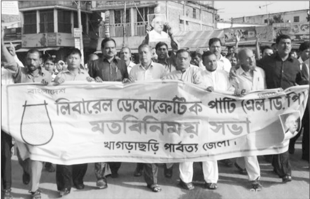
The newly formed LDP brought out a procession in Khagrachhari town yesterday.

Local people rushed them to Kalapara Health Complex where doctors declared Nuruzzaman dead.