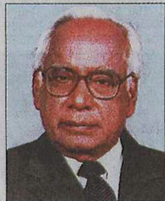
Prof Iajuddin Ahmed

The president appealed to all political parties and the people to