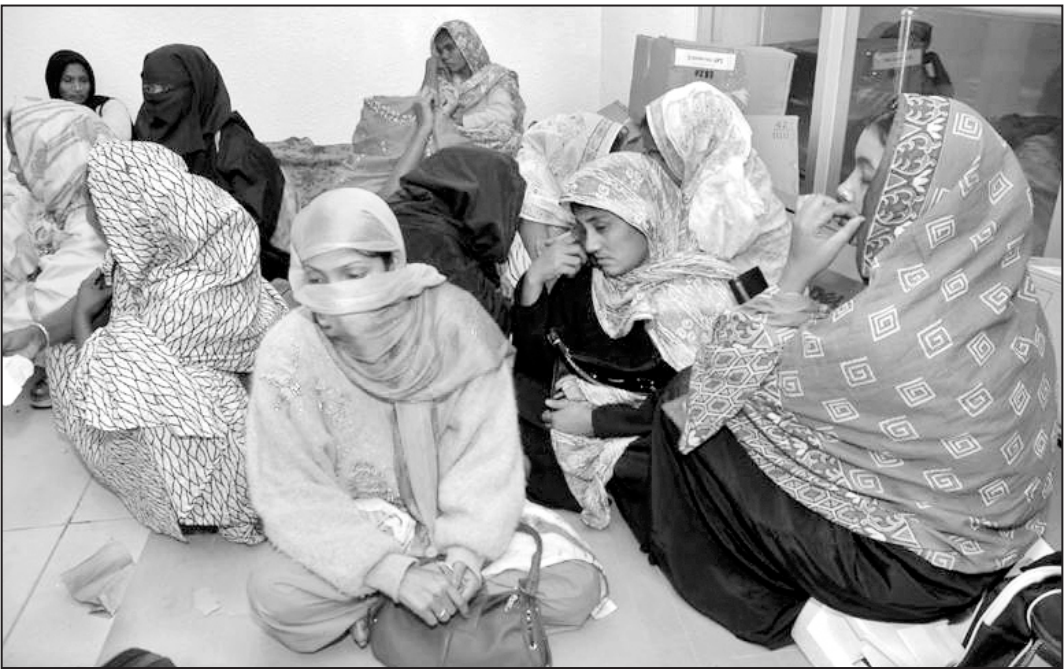
Immigration police rescue 31 women at Zia International Airport in the city yesterday, who were reportedly being trafficked to Libya. (Story on Page 1)