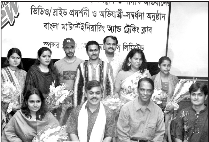
Mountaineers pose for photograph with the guests at a reception at the National Press Club in the city yesterday.

Relatives, friends and admirers have been requested to attend the mahfil to pray for salvation of the departed soul, said a press release.