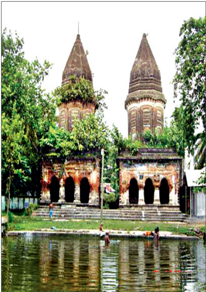
The twin temples in Mymensingh

temple where the idols have been erected. The temples are unique in design. Both temples are oblong in shape with little corridors on a high basement. A staircase connects the basement to the ground.