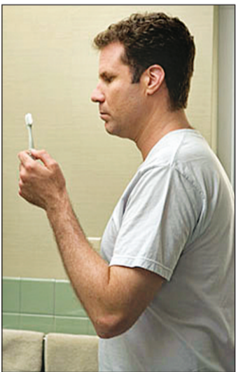
Will Ferrell in Stranger than Fiction