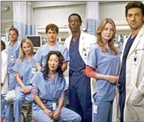
Grey's Anatomy On Star World at 10:30pm Drama Cast: Sandra Oh, Patrick Dempsey, Ellen Pompeo